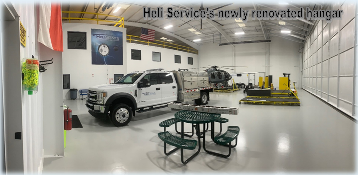
Heli Service's newly renovated hangar